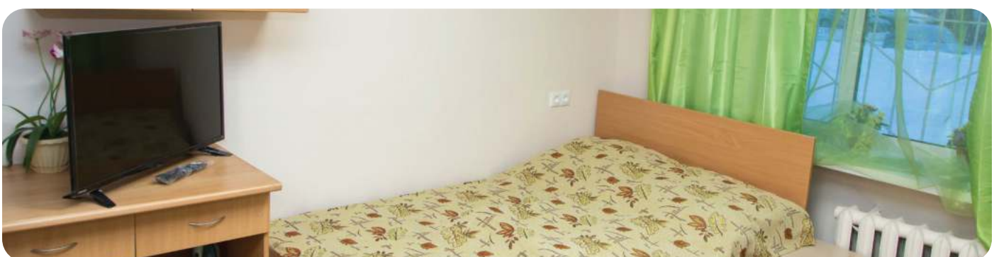
Rooms of the dormitory