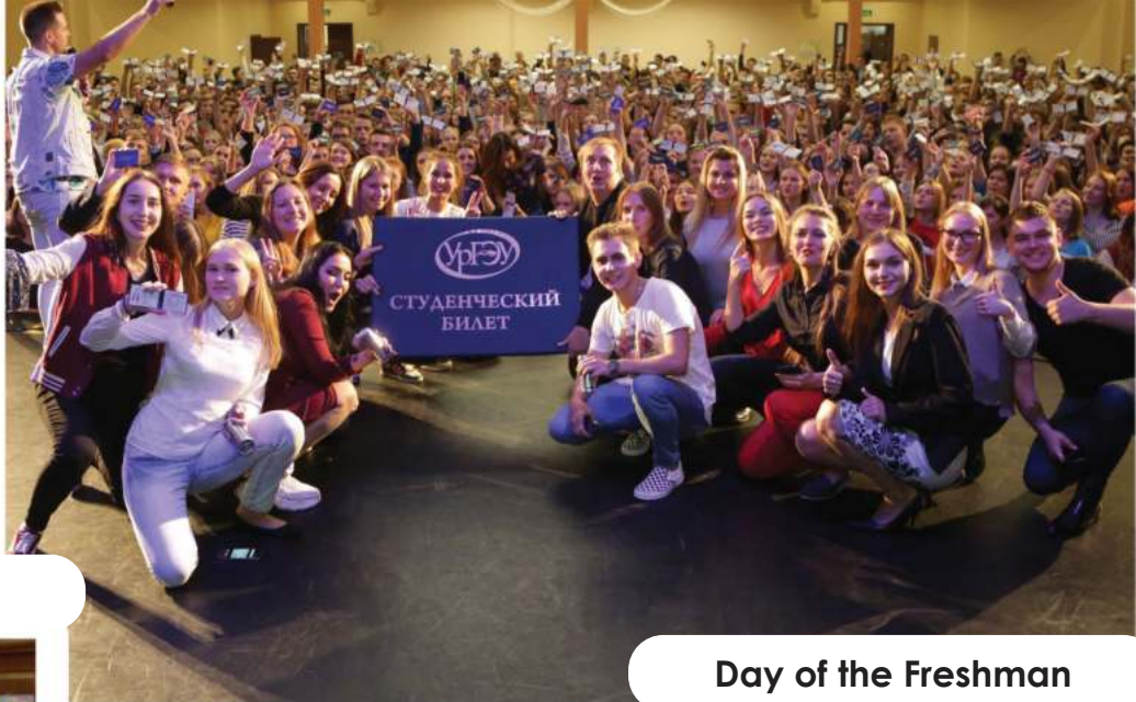
Day of the Freshman