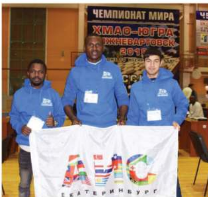
International Student Association